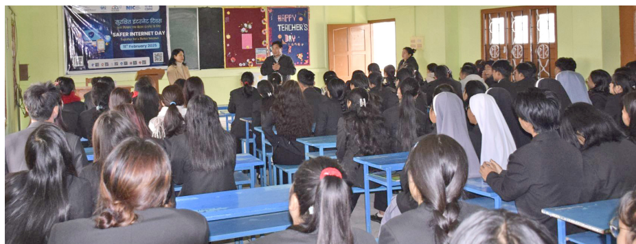
▼ Fig 6.1 : DIO, West Siang, conducting a Safer Internet Day awareness session on responsible and safe internet usage

To improve work efficiency and digital proficiency, regular ICT training programs are conducted for officials of the District