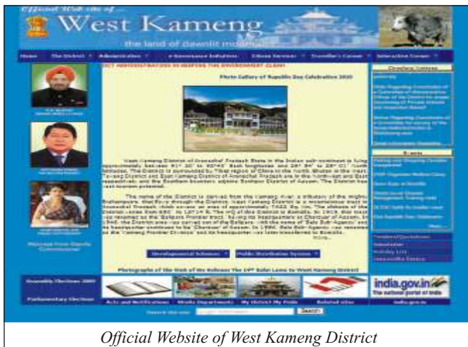
Official Website of West Kameng District

Web Site of the District: Designed & developed by the district centre, the official website ( http://westkameng.nic.in ) portrays the spirit of 'Right to Information' to the people besides giving necessary information about tourism and public distribution system. Special care was taken to choose the right color schemes to make it visually appealing, easy to use navigation systems and to make the website content rich in a professional manner. Details of activities of all Departments are uploaded to reveal the progress of the developmental schemes, which could also be monitored, thus increasing transparency and accountability by putting them in the public domain.