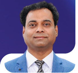
Shri Sanket S Bhondve, IAS Joint Secretary, MeitY

Gov.in Secure Intranet has transformed the way we handle day-to-day government operations by bringing multiple services, tasks, and collaboration tools onto a single secure platform. The seamless access to applications, structured task tracking, and built-in coordination features help officials stay organized, accountable, and responsive. By reducing dependency on multiple logins and scattered systems, this NIC developed platform, saves valuable time and supports faster, more informed decision-making. Overall, it is a reliable and productivity-enhancing digital workspace for government officials.