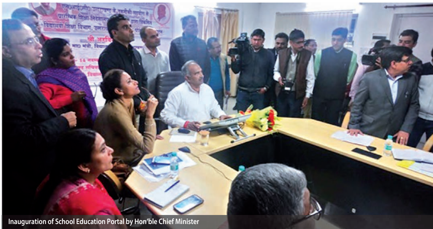
Inauguration of School Education Portal by Hon'ble Chief Minister

purpose of Board Exam Registration. Management schools in the State are also covered under this module. Every school (Government & Management) have been provided user-id and password to enter their student's details.