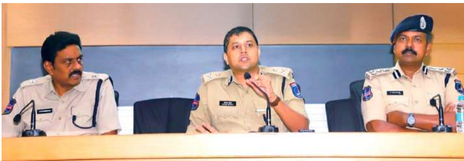
▼ Fig 10.1 : Inauguration of Cyberabad Police Permission Management System by Shri Avinash Mohanty, IPS, Commissioner along with higher officials

Email: sio-tg@nic.gov.in, Phone: 040-23229474