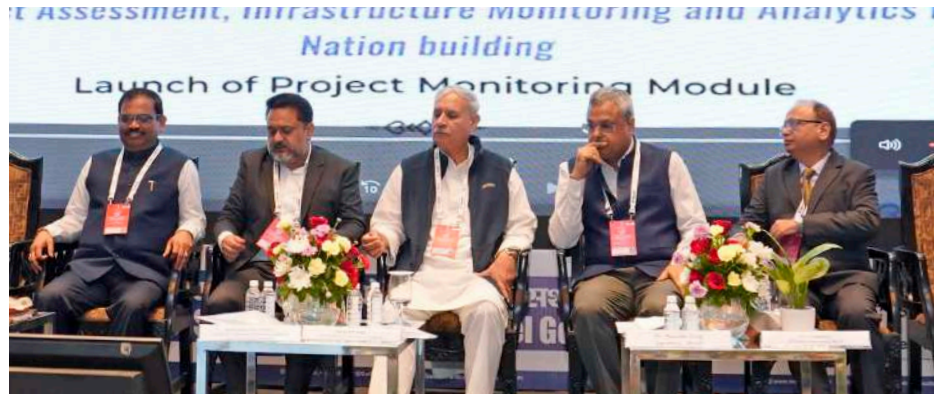
▲ Fig 9.2 : PAIMANA was launched on 25 September 2025 by Hon'ble MoS (S&PI), Shri Rao Inderjit Singh

The platform serves as a centralized project monitoring system, providing a single-window interface for ministries, departments, and implementing agencies to upload, tracks, and review project information. It features real-time dashboards with drill-down capabilities, enabling users to monitor progress across sectors, states, and timelines. Through secure RESTful APIs, the system ensures seamless data capture and integration from external servers. A role-based access control mechanism safeguards data and ensures accountability by granting customized access rights to different user categories.