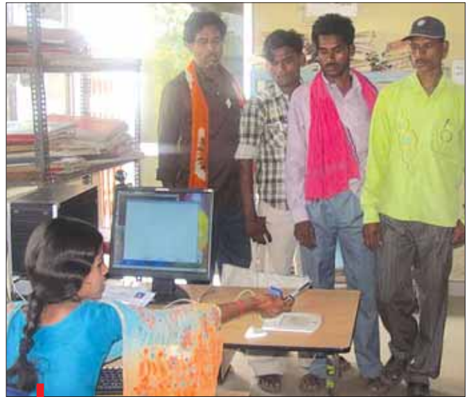
Staff at RTO capturing Biometrics for issuance of licenses

Networking: Realizing that success of any project lies mostly on the availability of reliable Network connectivity, NIC Raigarh has established LAN comprising forty nodes connecting important offices within the collectorate. Apart from 34 Mbps leased line, it has also provided VSAT based connectivity to all the blocks, treasury and sub treasuries. Video conferencing is another important facility provided by NIC in the district through which pub-