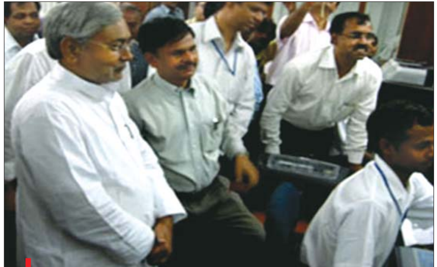
Hon'ble CM of Bihar, Sh. Nitish Kumar, along with Senior Officials during inauguration of Smart-Card based Driving License at DTO, Patna

THE successful joint venture of NIC and State Government departments have been in socio-economic sectors like Rural Development, Urban Development, Property Registration, Land Records, Surface Transport, General Administration, Social Welfare, Human Resources Development, Health, Agriculture & Animal Husbandry, Panchayati Raj, CGHS Wellness Centre, Lokayukta office etc.