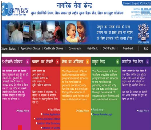
Nagarik Seva Kendra website

e-Mail service of NIC has been widely used by government officials in the state. Websites of various departments and organizations that are accessible through Govt. of Bihar website ( http://gov.bih.nic.in ) are helping common citizen at large in getting information and services. Several websites have incorporated multilingual technology to benefit the common masses. To promote IT culture in Bihar, NIC also imparts training on ICT tools and e-Governance projects to the state government and central