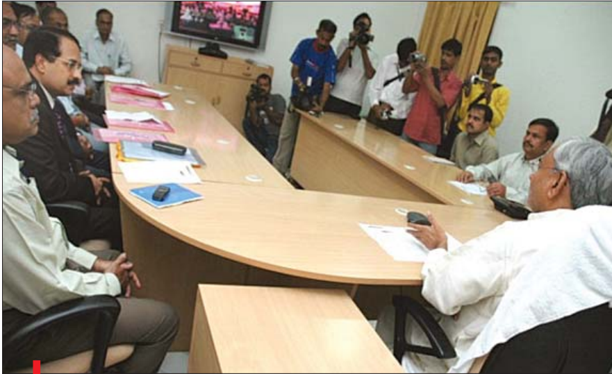
Hon'ble CM of Bihar, Sh. Nitish Kumar, inaugurating Rashtriya Swasthya Bima Yojna (RSBY) using Video Conferencing