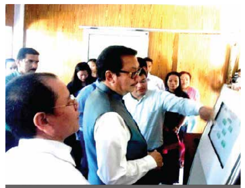
A Kiosk system – 'Lohit Information on Fingertip' was inaugurated by the Hon'ble Deputy Chief Minister, Shri Chowna Mein, in NIC Tezu, DC Office Complex, in presence of DC Lohit, Shri Danis Ashraf (IAS)