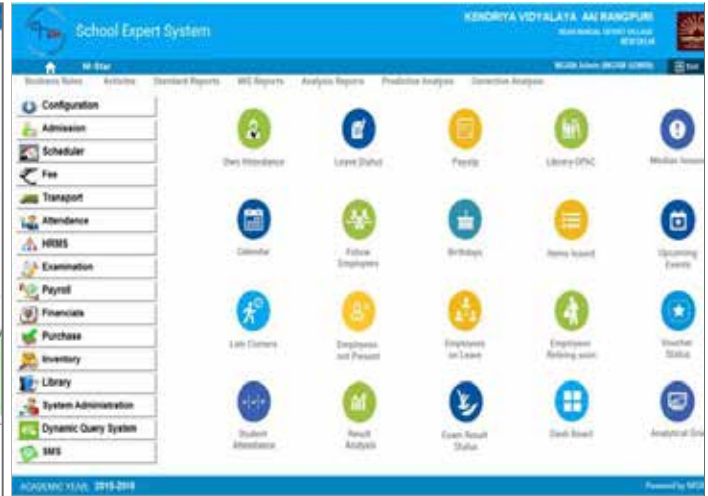
School Expert System screen