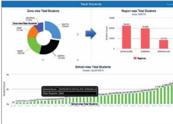
Visualization of Students Data in the Analytical Dashboard