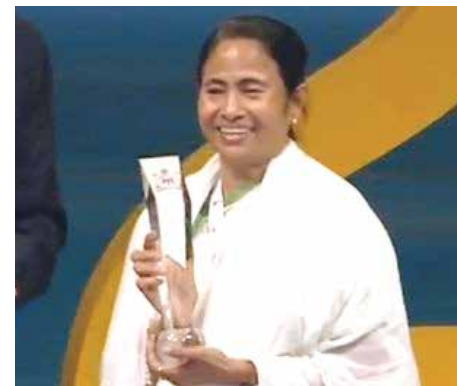
Hon'ble Chief Minister, Smt. Manta Banerjee with the the United Nation's Public Services Award 2017 conferred to Kanyashree project