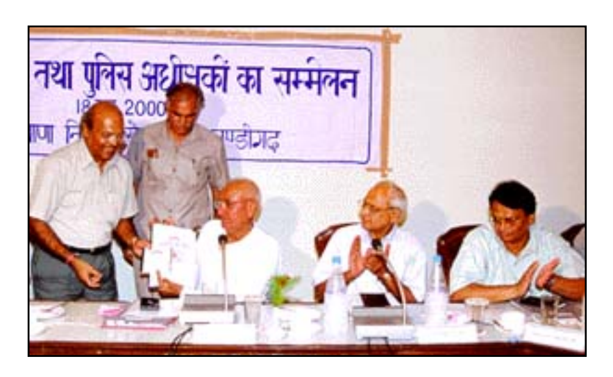
Haryana Chief Minister releasing the CD of HARIS software