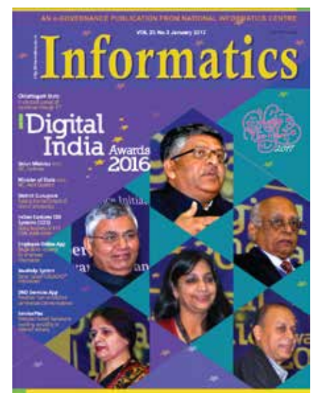
January 2017 Issue of Informatics