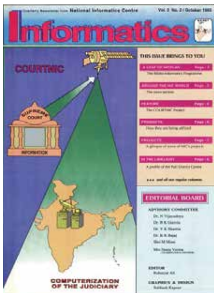
An early cover of Informatics

NIC has a pan-India presence with a network of over 700 offices countrywide and associated with offices of Central and State Governments and District administrations. We hope to turn Informatics into a single point of reference for information and updates on Government’s ICT programmes and activities in the country, especially the Digital India initiative. NIC’s pivotal role in implementing ICT initiatives has been widely acclaimed and I feel privileged for being associated with this esteemed organization and its publication, Informatics .