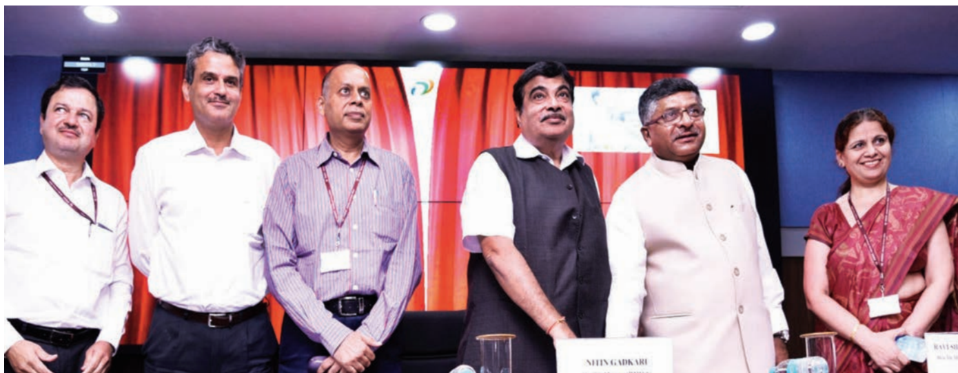
Launch of Integration of DigiLocker with Driving Licence and Vehicle Registration Certificate

are facing less hassle in getting their services. Leakages in government revenues have substantially reduced and overall environment in most of the RTOs has become more transparent and citizen-friendly.