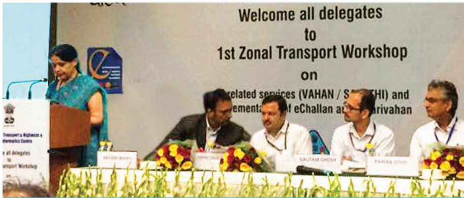
First Zonal Level Workshop held on 12th September 2018