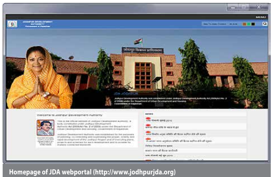
Homepage of JDA webportal ( http://www.jodhpurjda.org )