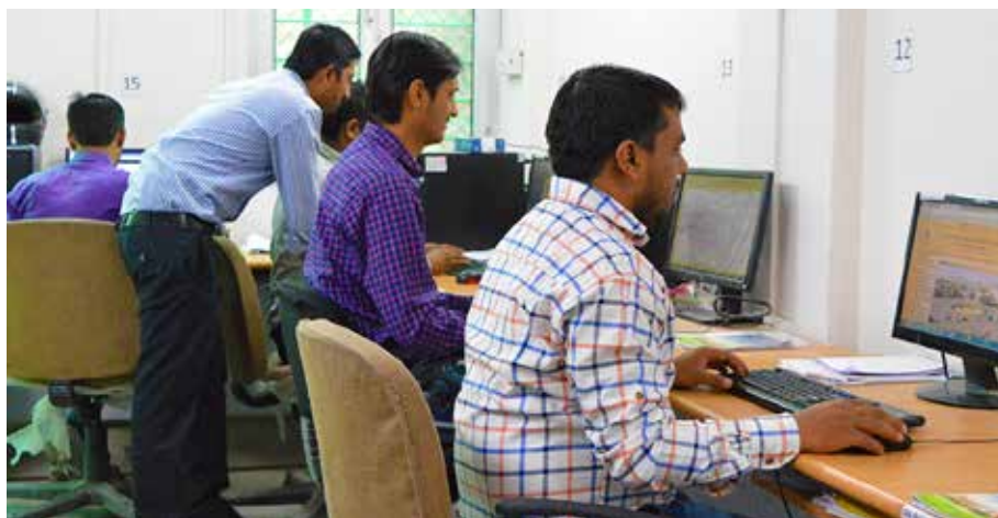
A busy day at NIC-JDA Cell

Hosted at NIC Data Centre New Delhi, the portal provides regularly updated information such as Online Lease Defaulter List, Online Property Register, Online Land Bank, Online CCC application status, JDA e-Newsletter, JDA Circulars & Orders, Acts & Rules, Telephone Directory, Zone wise Maps, Auctions, Tenders, Lottery Results of Schemes, Application Forms, Master Plan, Minutes of Meetings etc. The Portal has been developed using Core PHP with MySql Database and Apache Web Server.