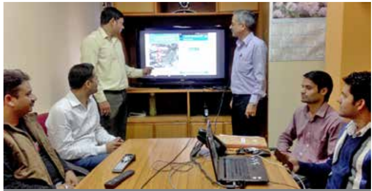
Review demonstration of the HP Telestroke Mobile App