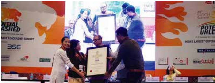
SKOCH 2017 Award-of-merit being conferred to the Civil Secretariat Wi-Fi LAN establishment

using the 5th generation advanced technology of Wi-Fi devices which provides faster and more scalable communication, NIC has enabled the freedom of wireless with the capabilities of Gigabit Ethernet. The architecture includes integration with the Network Operation Centre (NOC) of NIC for