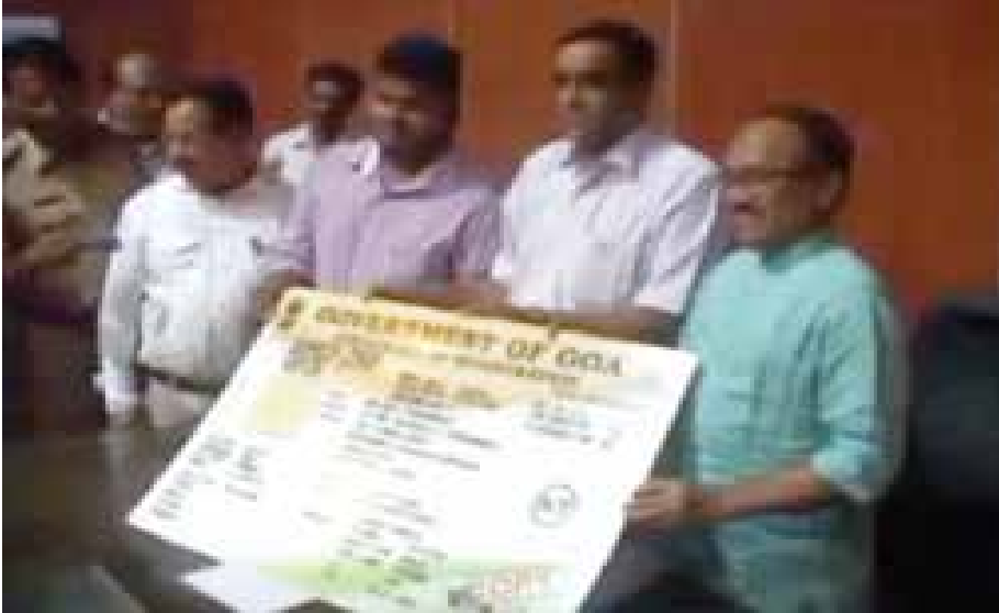
Services launched by the Hon'ble Chief Minister and Hon'ble Transport Minister of Goa