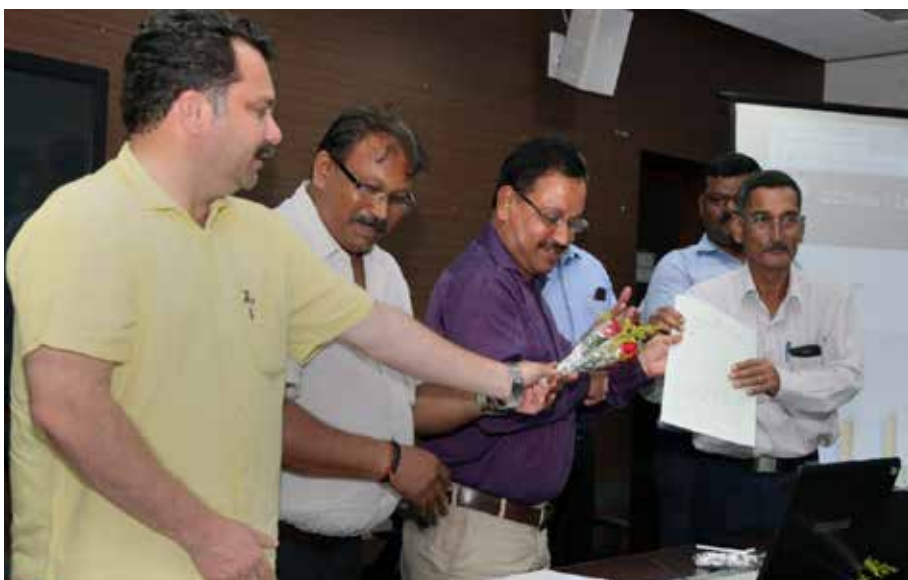
Shri Subhash Faldessai, Hon'ble MLA Sanguem, handing over the copy of Sanad to a citizen

DC*Suite is planned for replication at all other sub-divisions of South Goa District.