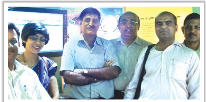
NIC Team at Commonwealth Express Inauguration