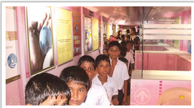
School Students visiting the train at Bhubaneswar