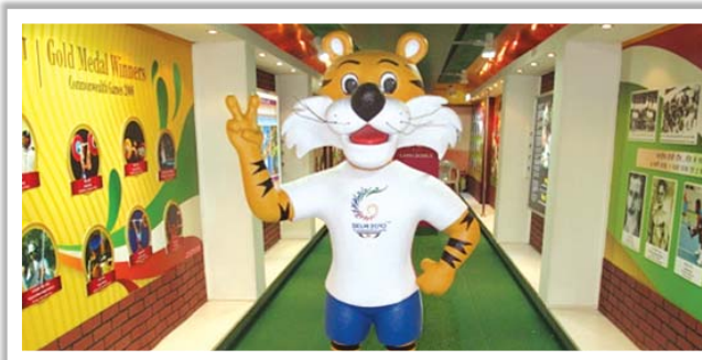
"Shera" the mascot of 2010 Commonwealth Games New Delhi

event was widely covered by local media and TV channels. At some places the exhibition timings had to be extended because of a huge rush. The Sports and Information Technology extravaganza caught the fancy of the masses in the far and wide corners of India through this Commonwealth Express and people went with unforgettable memories of nicely organised exhibition. The successful completion of this odyssey added yet another feather to the cap of this esteem organisation.