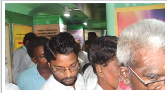
Citizens at Tamil Nilam Stall in Madurai