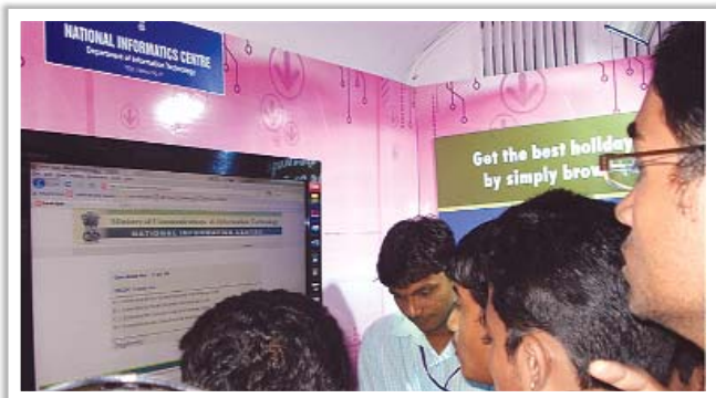
Students jostling for space at e-Quiz counter at Ajmer