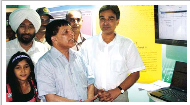
DC Una was highly appreciative of the e-Governance applications demonstrated by NIC