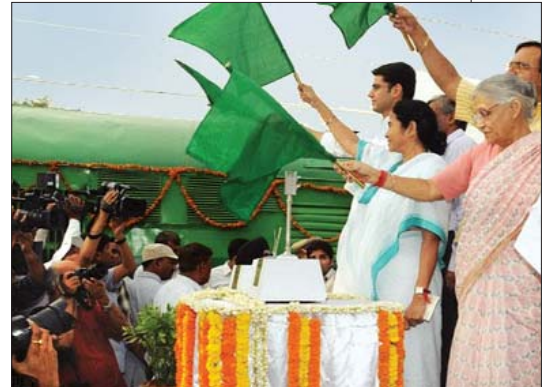
Hon'ble Union Minister for Railways Km. Mamta Banerjee, Hon'ble CM of Delhi Smt. Sheela Dikshit and Hon'ble Minister of State C&IT Sh. Sachin Pilot flags off the 'Commonwealth Express Train'

Out of a total of 11 coaches, five coaches were allocated to Railway Sports Promotion Board to showcase the history of Commonwealth Games, details of the venues of the events, to spread general awareness about different sports and to give wide publicity to the sports icons of India who have brought laurels to the country with their stupendous feats. In the remaining six coaches,