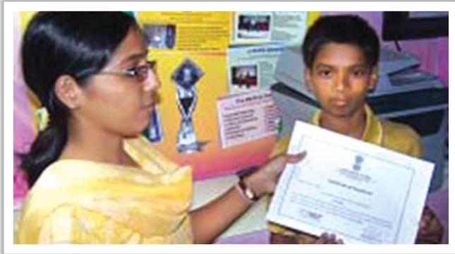
Certificate issued to a participant of e-Quiz at Ranchi