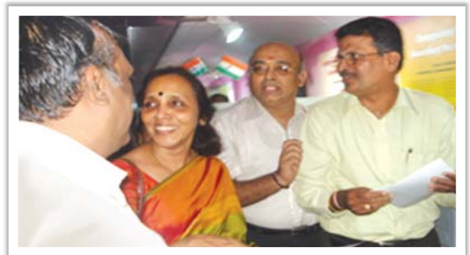
Dr. Poongothai A Aruna, Hon'ble IT Minister Govt of TN visiting NIC stall