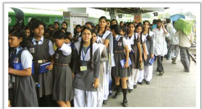
Students lined up at Lucknow to see exhibition