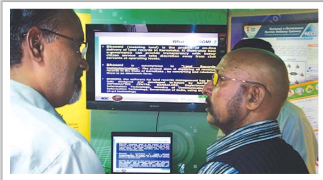
SIO, Karnataka highlighting the Bhoomi application to Syed Kirmani, Cricketer in Bangalore