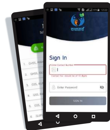
Yathasarvam Mobile App

incremental progress made from February-March 2019. A complimentary letter from CEO, NITI Aayog, was also received in this regard.