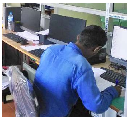
Mini Data Centre of the District Administration, under the Aspirational Districts Programme