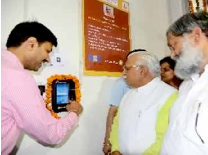
Demonstration of Attendance Kiosk to CM Haryana during the AEBAS inauguration at Mini Secretariat, Panchkula

tee has been constituted by Chief Secretary Haryana headed by ACS, IT.