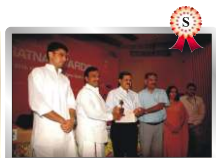
Ministry of Rural Development