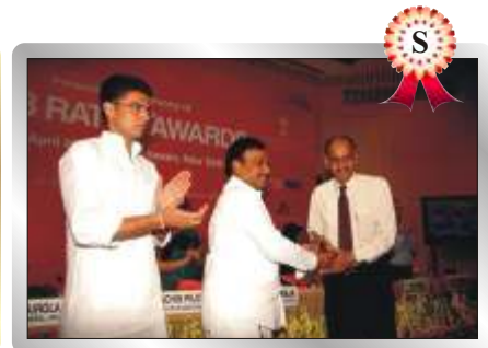
Ideas for CM