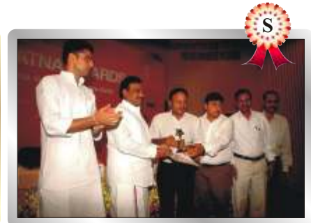
Justice through ICT