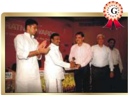
The m-Governance Mantra