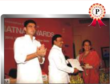
Department of Economic Affairs