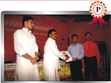
Indian Tsunami Early Warning System