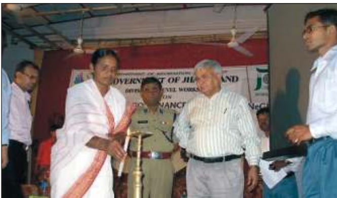
Hon'ble Minister Smt Jobha Manjhi, inaugurating e-Governance Workshop at Chaibasa