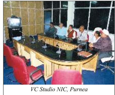
VC Studio NIC, Purnea

Video Conferencing & e-mail: The Video Conferencing service has been provided using VSAT as well as Leased Line connectivity. The NICNET connectivity has also been provided to different offices in the district facilitating e-mail utility to all senior officials for faster communication and exchange of important documents. These services are available on 24x7 basis.