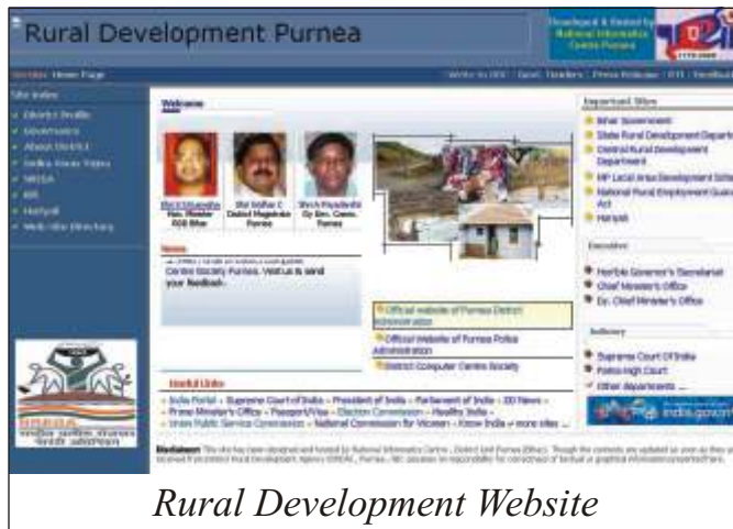
Rural Development Website