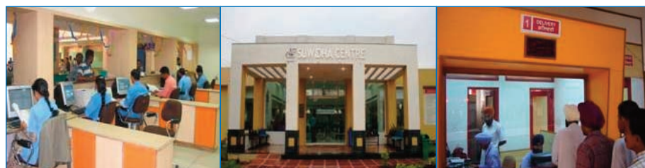
State of art SUWIDHA centres at Jalandhar and Patiala