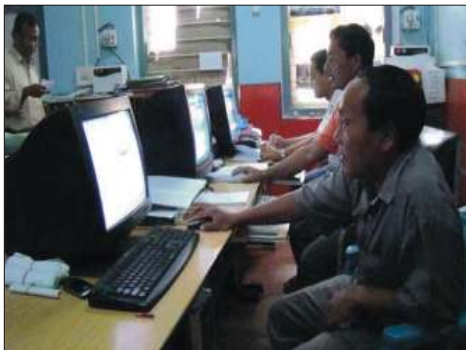
Staff of Electricity Department preparing bills