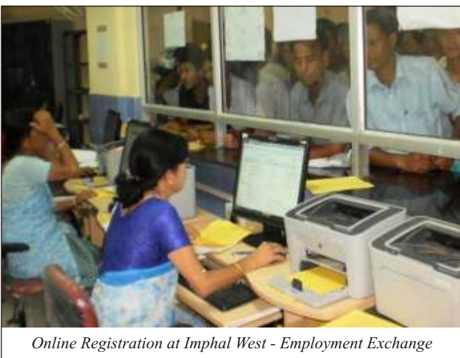
Online Registration at Imphal West - Employment Exchange