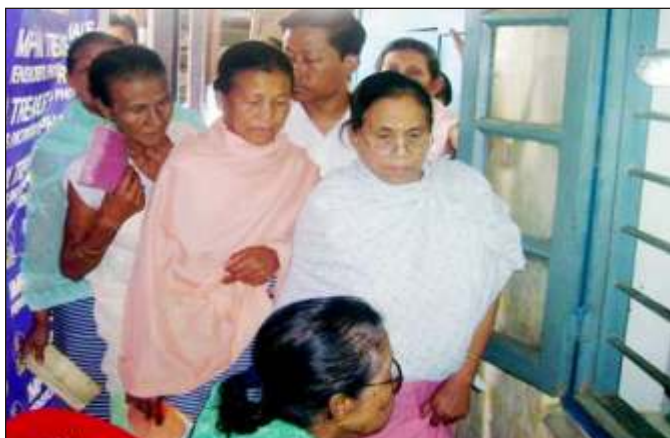
Pensioners at the Pension Office

Pensioner's data and the status of release of monthly pensions are made available on the web, which constitutes a major step towards promotion of e-Governance.