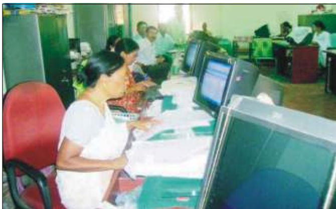
Bill Processing at Imphal Sub- Treasury

Pune model at all the 16 Treasuries/Sub-Treasuries of Manipur. Online Counters were opened for processing the bills submitted by departments. Bills are processed by authorized users only.