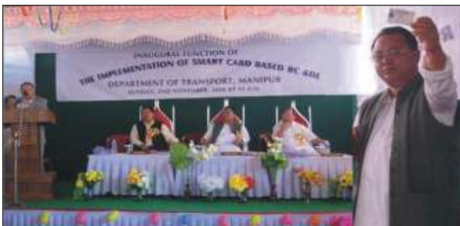
Inauguration of Smart Card by Hon'ble Transport Minister L. Jayantakumar