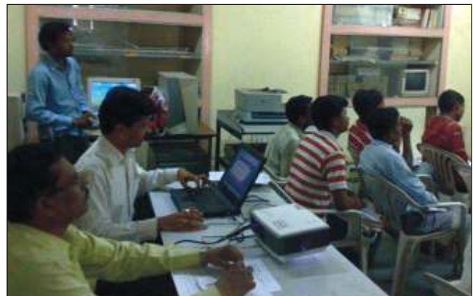
NYKS Demonstration at NIC Chandrapur

The objective of this Workshop was to show current E-Governance initiative by state and central government and trend thereof and to motivate volunteers to use latest technology in their noble service to the citizens.