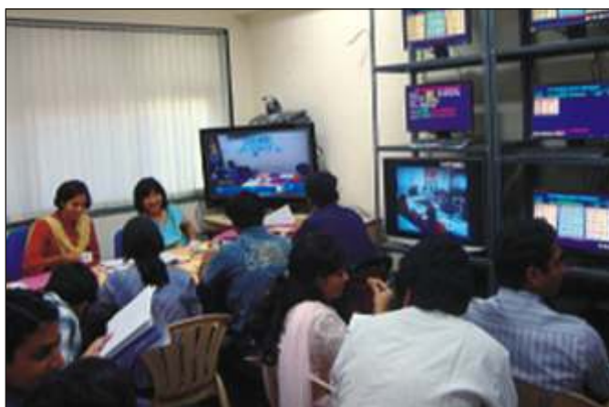
Inauguration of State level workshop on AGMARKNET