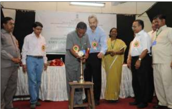
Inauguration of State level workshop on AGMARKNET

Computer services are provided to the following offices at Mumbai as part of the NIC Central Government Projects: Passport, Customs, Trade Mark, Textile, High Court, Post Office, PAO, CGHS, Agmarknet, Fisheries, census, and bureau of immigration. Projects of NREGS, CONFONET and NSAP are implemented successfully in districts of Maharashtra.