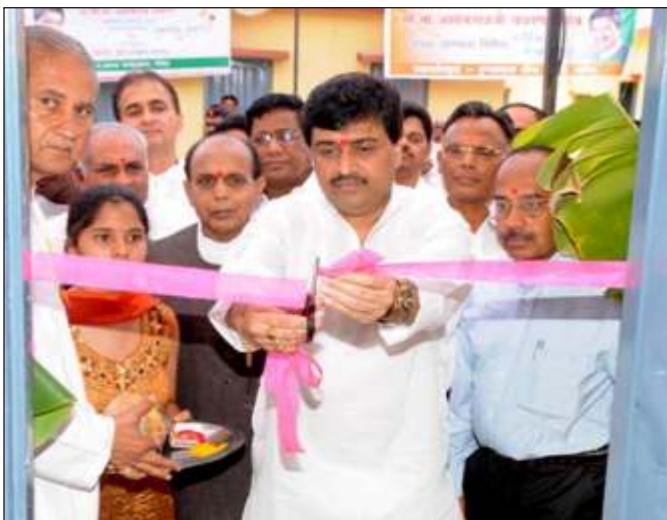
Hon'ble Chief Minister Sh. Ashok Chavan inaugurating the CSC at Nanded

Hon'ble CM, Sh. Ashok Chavan inaugurated the village common service center for distribution of 7/12 extract to khatedaras on 25th May, 2010 at Mudkehd tehsil Nanded District. State level register of 7-12 extract record is created on the website http://mahabhulekh.mumbai.nic.in for providing the printed information of Record of Rights and property card to the citizens and other stakeholders through common services centres.