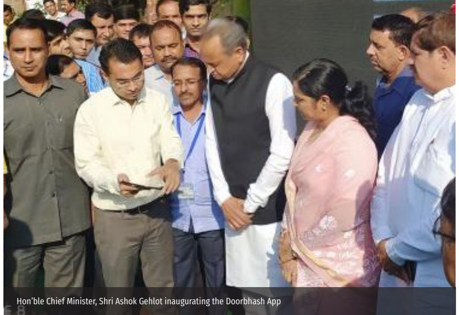
Hon'ble Chief Minister, Shri Ashok Gehlot inaugurating the Doorbhash App

- monitors all type of court cases. It generates a list of pending cases till particular date and other MIS reports.