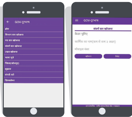
▲ Gov-Doorbhash App