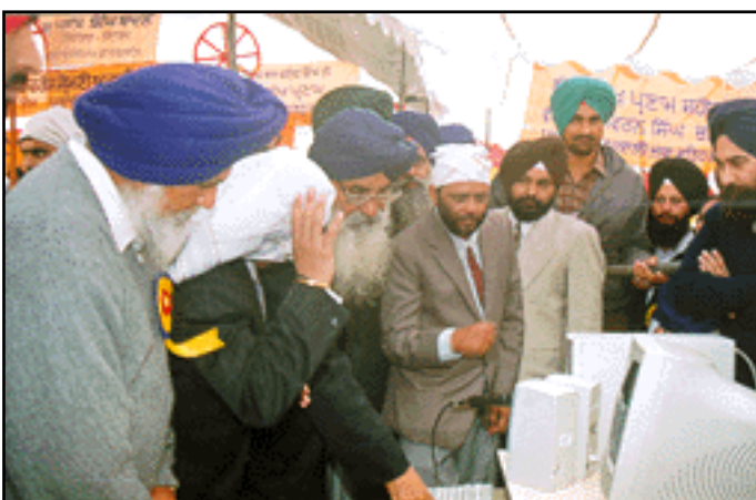
The web site of Distt Fatehgarh Sahib being inaugurated by Sh. Prakash Singh Badal, Cheif Minister, Punjab

computerized M.I.S. These include MIS for Village level Development Indicators, Grants Monitoring System, Micro Planning for terrorist/ riots Focal Point Schemes, Link road Repair Monitoring System, Database of Beneficiaries of Social Security Schemes, Database of terrorist/ riots effected persons, Arms Licensees, MIS for Revenue Recoveries, MIS for Total Literacy Compaign, MIS for Cooperative Societies, PLAN-MIS, Twenty point Monitoring system, Small Savings Schemes Monitoring, Computerization of District industries Centre, DRDA Computerization, Reference monitoring System and Payroll & GPF Information System. Also, the Computerization of DRDA under Client Server environment is in progress and Computer Centre for Rural Youths under TRYSEM is already running in Distt. Fatehgarh Sahib. Beside the above, NIC Unit was also actively involved in the implementation of Information system for conducting National wide special Health checkup programs for schools in July 1997, conducting Lok Sabha polls in Feb., 1998 and Panchayat Samiti polls in May 1998.