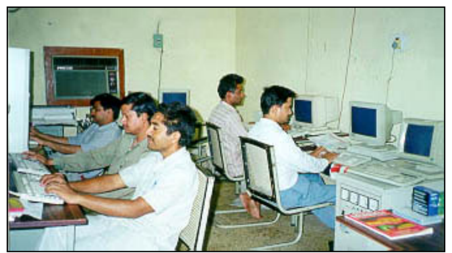
Staff of NIC Santa Unit on a busy day