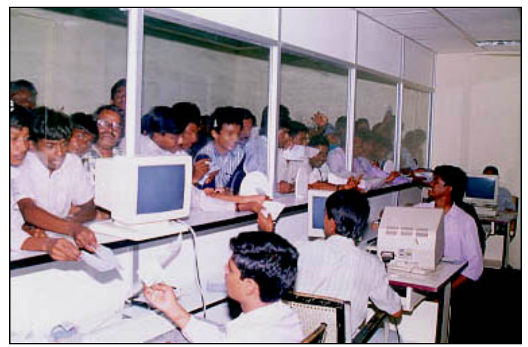
Students flocking to NIC Centre for obtaining Results