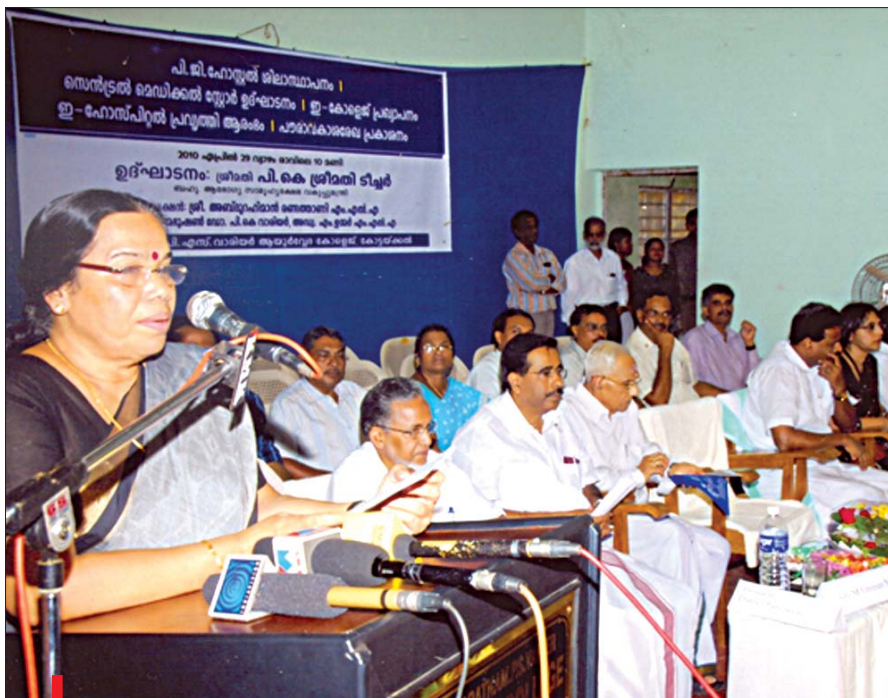
Inauguration session of e-College at VPSV