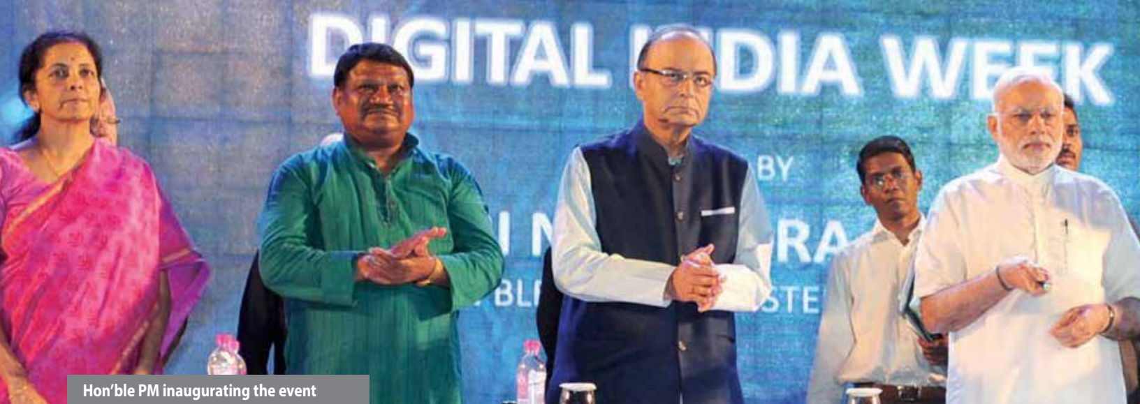
Hon'ble PM inaugurating the event