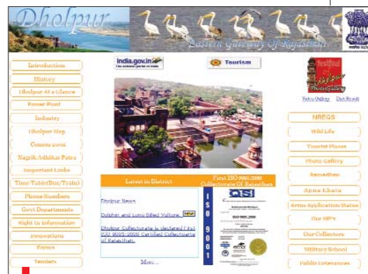
District website of NIC Dholpur

of Public Grievances. Each complaint lodged is individually monitored and tracked until it is finally disposed. Footfall to the collectorate is also reduced as the status is available online, on telephone and through touch screen kiosks. So far more than 16500 cases have been disposed off and the software is running successfully in dozen districts of Rajasthan.