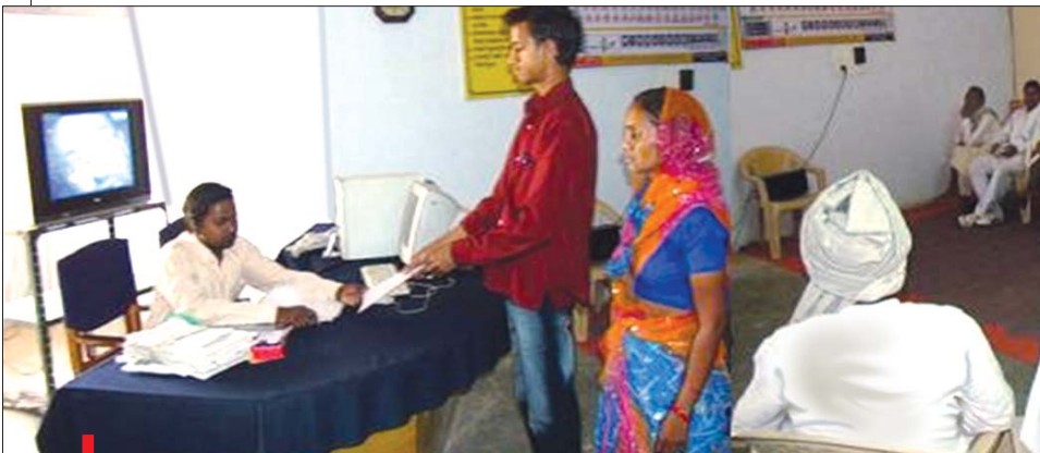
Citizens at Paramarsh Kendra

System: Helpdesk manned by trained volunteers to aid citizens with writing applications, filling forms, informing about beneficiary schemes and monitoring Public Grievances. A software has been installed in the center to keep track of citizens, which kind of people are being helped. It has also helped in cutting down the role of 'mediators' and other middlemen who profit from citizens' troubles.