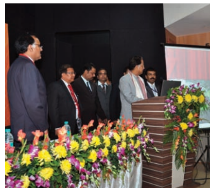
Hon'ble Chief Minister of Assam Shri Tarun Gogoi inaugurated the MIS for PPP Projects on February 14, 2012.

Public Private Partnerships (PPP) is about bringing together social priorities and the managerial skills of the private sector, relieving the government from the burden of large capital expenditure and the risk of cost overruns to the private sector. Instead of transferring public assets to the private sector, as in case of privatisation, the government and business work together to provide services under PPP mode. Broadly PPP refers to an agreement between government and the private sector for