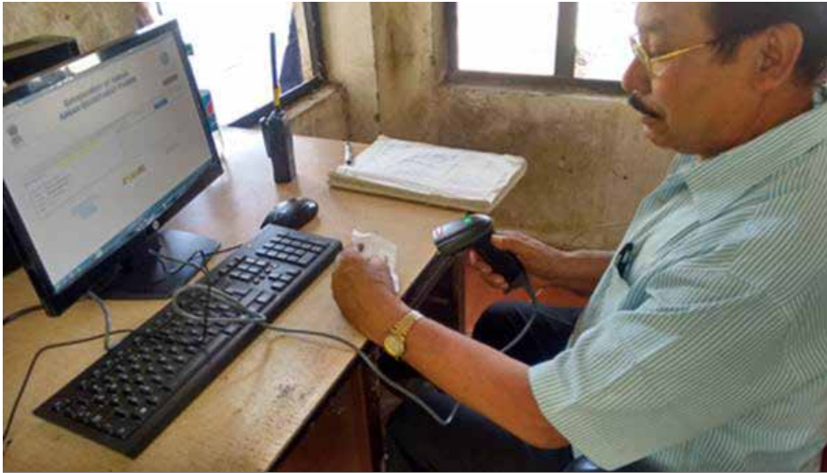
Security personnel scanning bar code for validating visitor entry