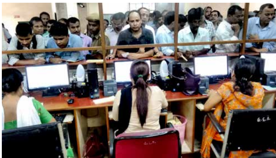
e-Pass application counter at the Public Facilitation Centre of Assam Secretariat

Ensuring the genuineness of car passes through mobile app enables the security to detect car passes obtained fraudulently. SAD plans to outsource this application shortly for implementation and maintenance of hardware in the Secretariat. Outsourcing this application will not only generate employment but will also contribute to economic sustainability of the project.