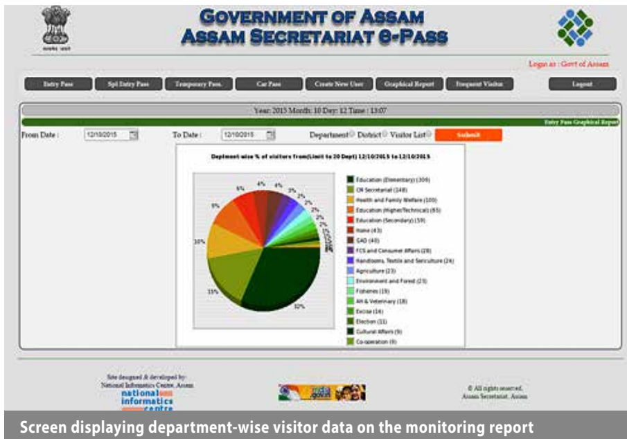
Screen displaying department-wise visitor data on the monitoring report