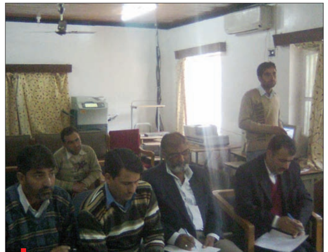
Training Session in Progress

It has been launched with an aim to modernize management of land records, minimize scope of land/property disputes, enhance transparency in the land records maintenance system, and facilitate moving eventually towards guaranteed conclusive titles to immovable properties. Accordingly, an action plan has been prepared and submitted for approval.