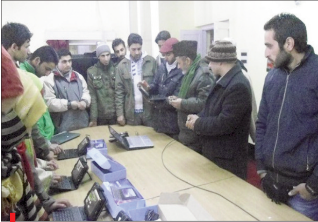
SECC Charge centre at NIC Kupwara

can check their pay, accounts, promotions and other administrative details.