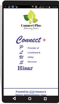
▲ Connect Plus Haryana