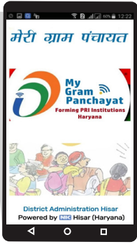
▲ MyGP Mobile App