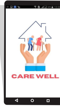
▲ CARE WELL App