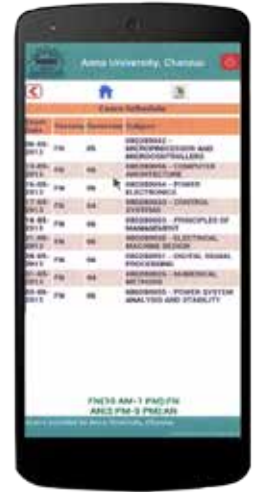
Android Mobile App

Success of this web application has already been reaped by all the stakeholders as the web application has appreciably speeded up the entire processing right from capturing the students profiles till the results declaration after the revaluation of answer scripts.