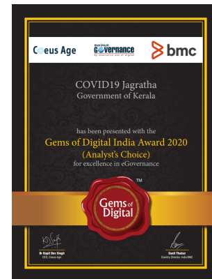
▲ Gems Digital India Award 2020 for Covid19Jagratha

administration and NGO based on the offer. Dashboards in public and private domains are provided.