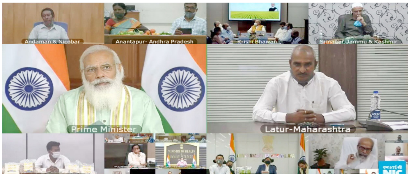
▲ Hon'ble Prime Minister interacting with farmer from Maharashtra on 14th May 2021 via NICNET

This Project received the Best G2B Initiative Award in 2013 and Best Performance Award for implementation of e-Procurement in January 2018.