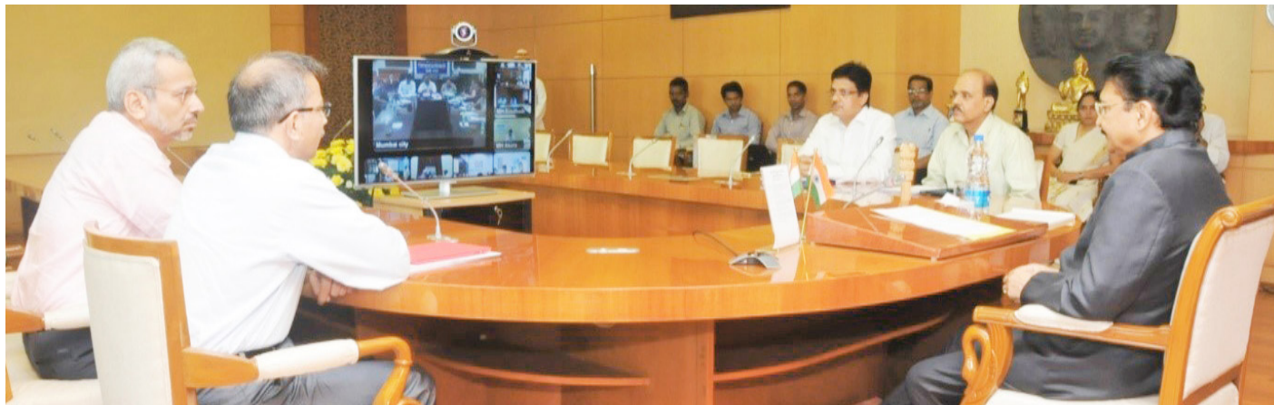
▲ Hon'ble Governor of Maharashtra, Principal Secretary to Hon'ble Governor, SIO Maharashtra, and other officials during Rajbhavan portal inauguration

Some of the premier institutes like IIT Bombay, TIFR Mumbai are connected to this NKN PoP over redundant links of 10 Gbps. This PoP also caters to Internet Gateway Services to NKN/ NICNET users in Maharashtra as well as other states. The total internet bandwidth capacity from this PoP is 36 Gbps through various ISPs. Google cache servers, as well as Akamai cache servers, are also co-located here for the NKN/ NICNET users. This PoP is functional on a 24x7 basis.