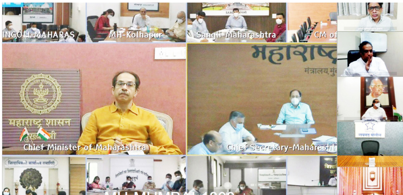
▼ Hon'ble Chief Minister, Chief Secretary, and other senior officers during a Video Conferencing