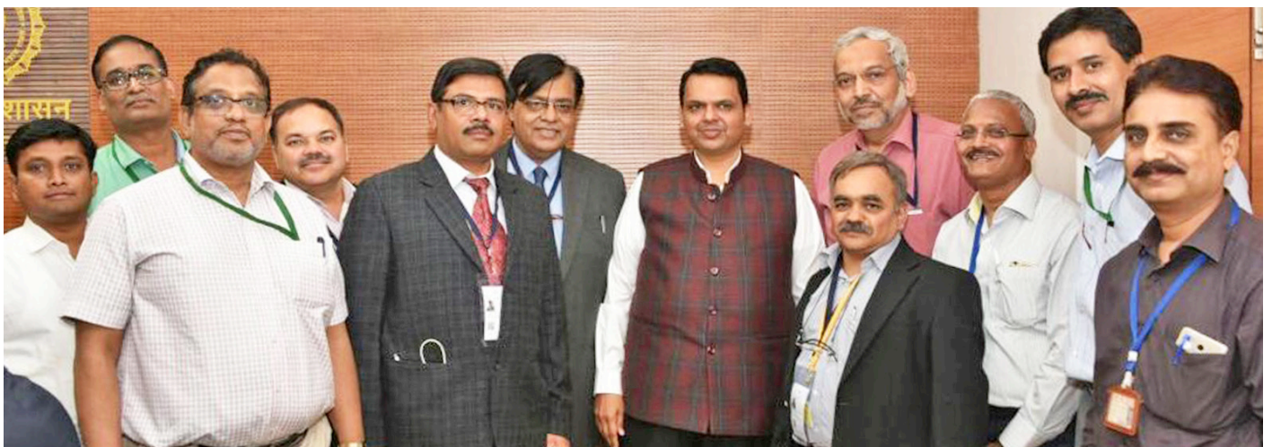
▼ Hon'ble Chief Minister (Former) of Maharashtra, SIO Maharashtra, HoG GIS Division, NIC HQ, and senior officers from NIC HQ and Mumbai

Manav Sampada (eHRMS) application facilitates monitoring of recruitments, postings, promotion, transfer based on employee skill set