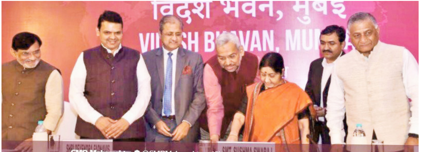
▲ Launch of the document verification software at Videsh Bhavan, inauguration function by the then Union External Affairs Minister in the presence of Shri Devendra Gangadharrao Fadnavis, Hon'ble Chief Minister (Former), MoS External Affairs and other dignitaries.

39 lakh patient registrations have been done using the software. Online Registration System (ORS) is also implemented in 39 hospitals in Maharashtra.