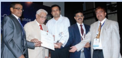
Project Team of Janmitra Samadhan Kendra receiving Certificate from Hon'ble Governor of Odisha, Shri M.C. Bhandare