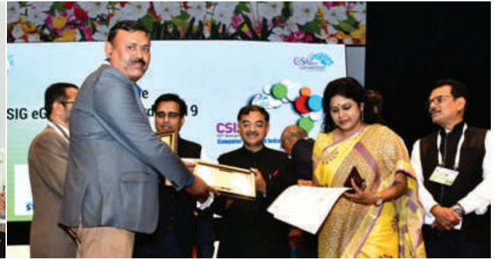
▲ Shri Nitish Kumar, Hon'ble CM, Bihar, releasing Tatkal Sahayata through e-Labharthi Portal