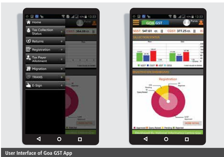
User Interface of Goa GST App

Goa GST System was made operational on 1st July 2017 and is 100 % paper less system. It is designed as a "step towards migration from desktop to tab" by integrating e-sign feature in Android platform for approvals. It is tightly coupled with GSTN and is successfully operational. All efforts are being made for the product roll-out in other states.