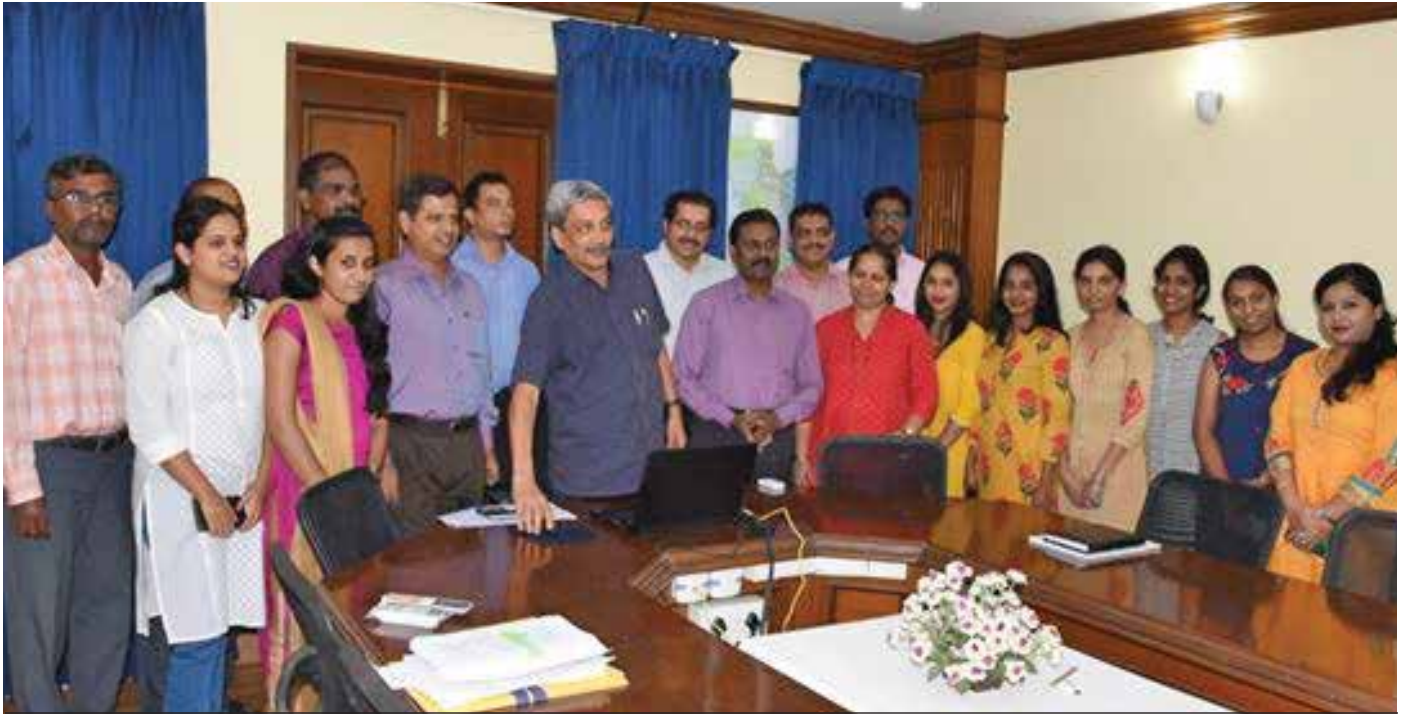
Inauguration of GoaGST website by Hon'ble Chief Minister of Goa, Shri Manohar Parrikar