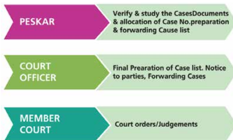
Schematic graphic representation of the 3 Tier System in other Courts

For further information, please contact: