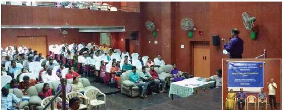
State level training at Chennai

Dental surgeons and 262 Dental Assistants. The number of family registrations has exceeded 1.3 lakhs and more than 2.5 lakhs were screened. The programme ensures that every individual of the population gains access to diagnosis, hysto- pathological conformation, treatment and palliative care. The Mobile App is acting as one of the key enablers to quicken the process of screening, diagnosis, follow up and treatment, which otherwise would have gone unnoticed ending up being fatal to citizens who are ignorant.