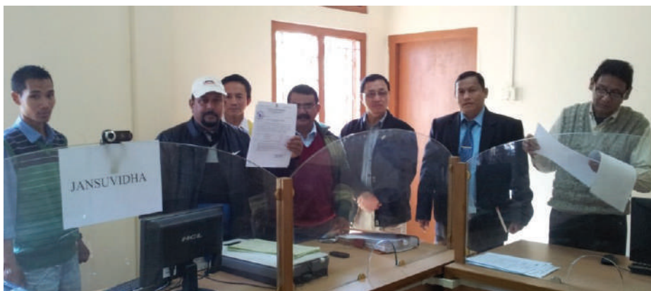
▲ Inauguration of Jansuvidha Centre at Changlang District