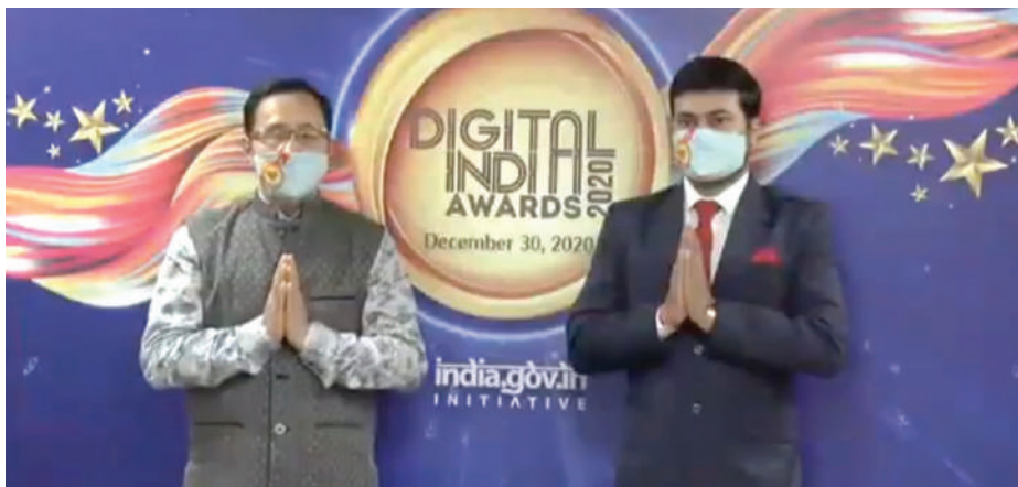
▼ Receiving Digital India Award 2020