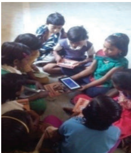
▼ Kids using Tablet for learning

Under the PDS Scheme, digitization and distribution of Ration Card are already done for the citizens. ePDS being effectively implemented for the Distribution of grains and pulses to the ration cardholders. Smart card RC allows, ration to be purchased using biometric verification as well as through Smart cards. Smart cards in the name of the woman have been created for every household and about 350 of the 450 households have been registered.