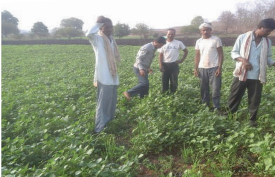
▲ Farmers and youth are trained for the Kisan Suvidha and AgriMarket

village. Separate counter setup for MGNREGA and other Social scheme Payments in Bank. Cashless transactions are being carried out in shops and hotels using the Bhim app and PayTM.