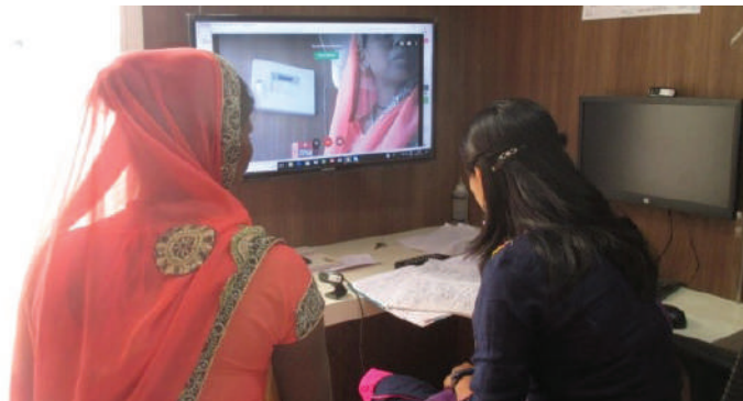
▲ Tele-Medicine Session with Super Speciality Hospital

In one ZP school and two ashram schools, primary and secondary instruction is aided through video content that has both instruction and practice exercises. Children were seen engaging with the content by reading sentences aloud and solving math problems. Chaitanya Technologies has also provided each school with five tablets each to promote e-Learning. 54 Aganwadi students and 665 ZP school students are benefited from e-Learning.