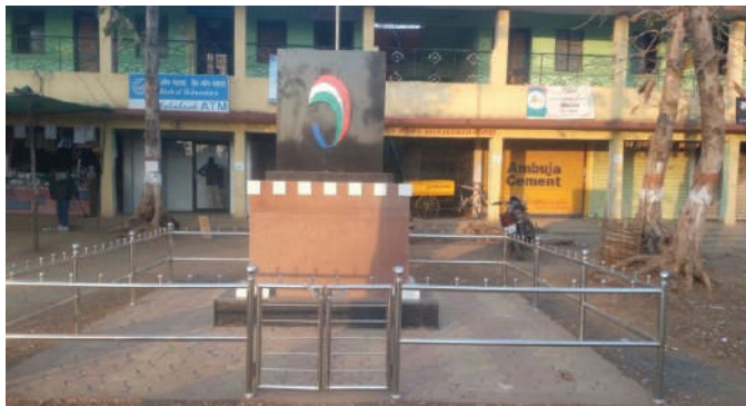
▲ Digital Village Harisal Logo