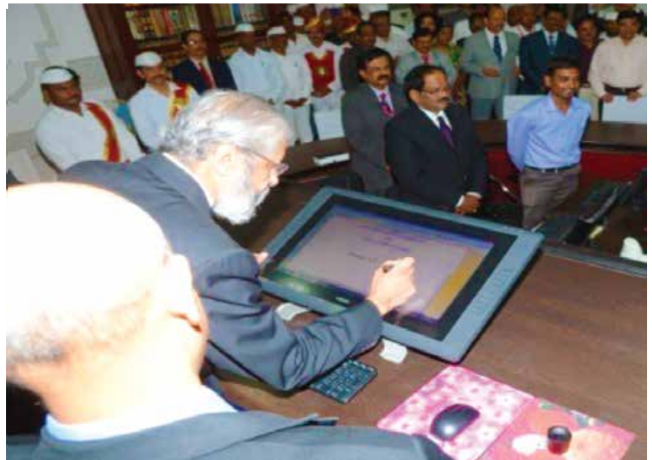
Hon'ble Judge making his remarks on the Touch Screen Monitor of eCourt

The identified case records for the particular court are scanned in advance with proper book markings of the relevant papers. Generally, the process of scanning is outsourced to private vendors for the sake of convenience. Once the scanning