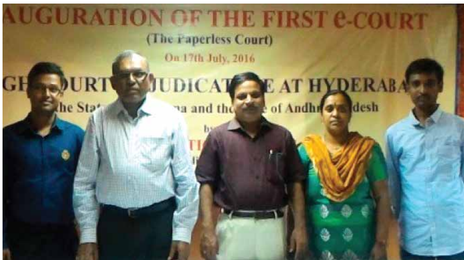
eCourt Team members of NIC at the inauguration venue

Touch Screen Monitors shall also be provided in the court hall for use by the learned Advocates for e-arguments. Advocates who want to use their own Laptops and Tablet computers should be provided with the case data well in advance so that they can argue their cases with the PDF case files made available to them.