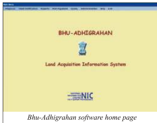
Bhu-Adhigrahan software home page

Bhu-Adhigrahan (Land Acquisition Information System): Government acquires land for various projects of public interest, making the process an important exercise. NIC associated itself and developed, implemented “Bhu-Adhigrahan” software, which monitored compensation and acquisition cases for the district administration thus making it an important e-governance activity. The software has been developed in VB.Net and SQL server 2000 database.