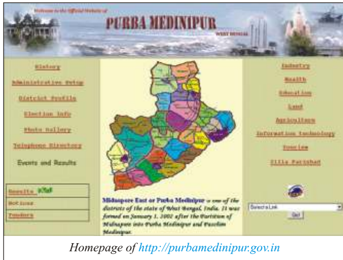
Homepage of http://purbamedinipur.gov.in

provides examination results and 'Tenders' are for uploading tender details. Facts and figures in the sectors like industry, agriculture, health, tourism, etc. are also available.